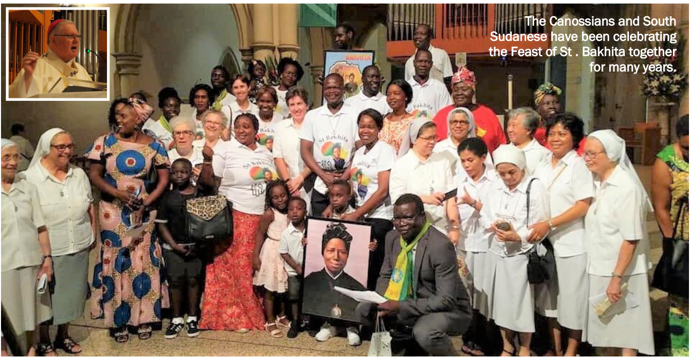
The Canossians and South Sudanese have been celebrating the Feast of St. Bakhita together for many years.