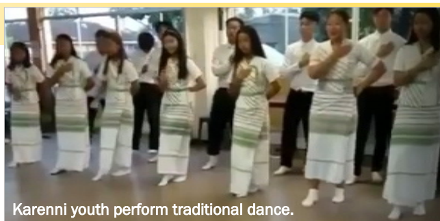
Karenni youth perform traditional dance.