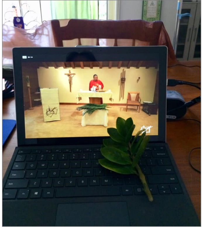
Above: Mass accessed online on Palm Sunday.

The Multicultural Pastoral Care website provides a list of the above-mentioned Mass online in various languages. <u>http://multiculturalcare.org.au/diversity/faith-online/</u> The website also provides introductory background on each cultural community. <u>http://multiculturalcare.org.au/</u> <u>diversity/faith-online/</u>