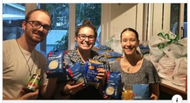
CATHOLICLEADER.COM.AU UQ Chaplaincy and Latin American community bringing food and hope to students in need | The Catholic Leader